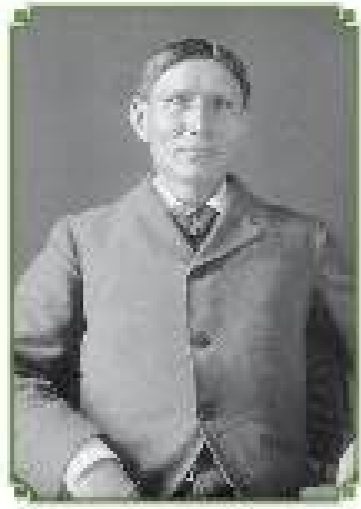
Charles Alexander Eastman in European clothing

Ohiye S'a, whose English name was Charles Alexander Eastman, was a member of the Dakota tribe of Native Americans. A writer and doctor, he was the first to write about tribal life from the Native American viewpoint.