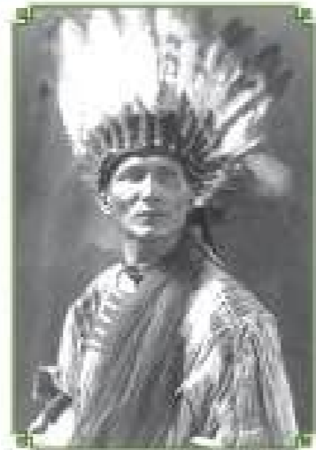
Ohiye S'a in Dakota clothing

Born in Minnesota in 1858, Eastman wrote Indian Boyhood in 1902. It tells about the first fifteen years of his life. Below is a passage from Indian Boyhood .